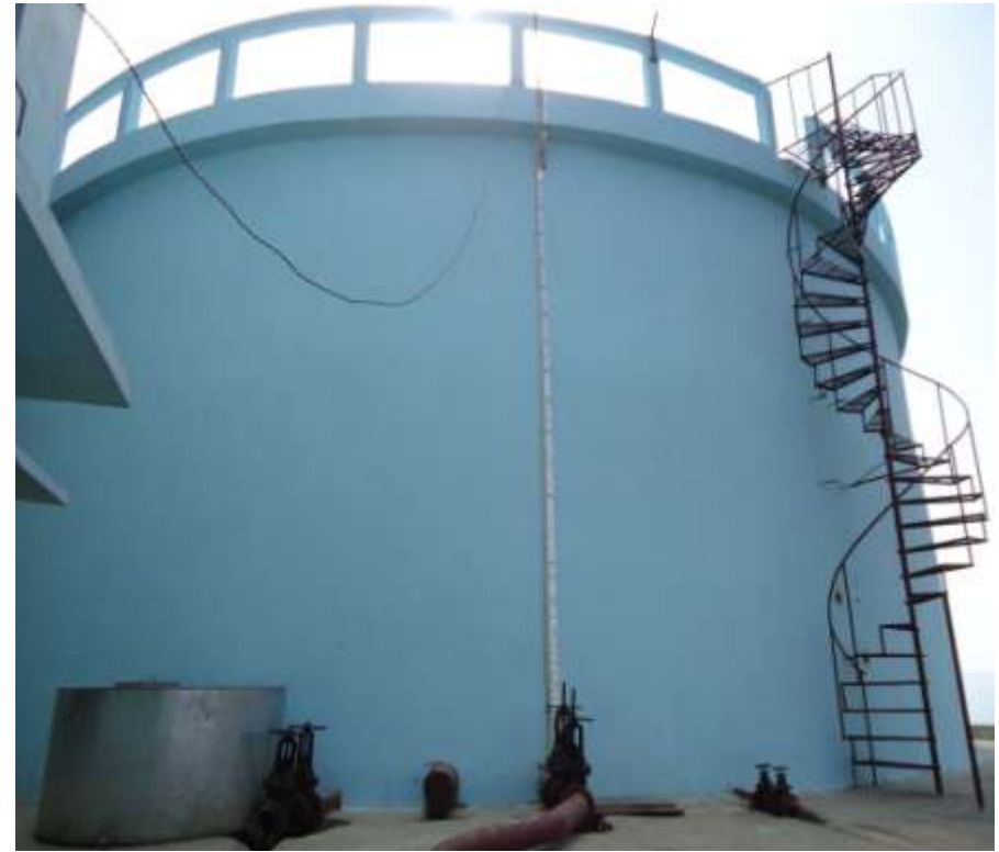
Seventhday Tlang Reservoir