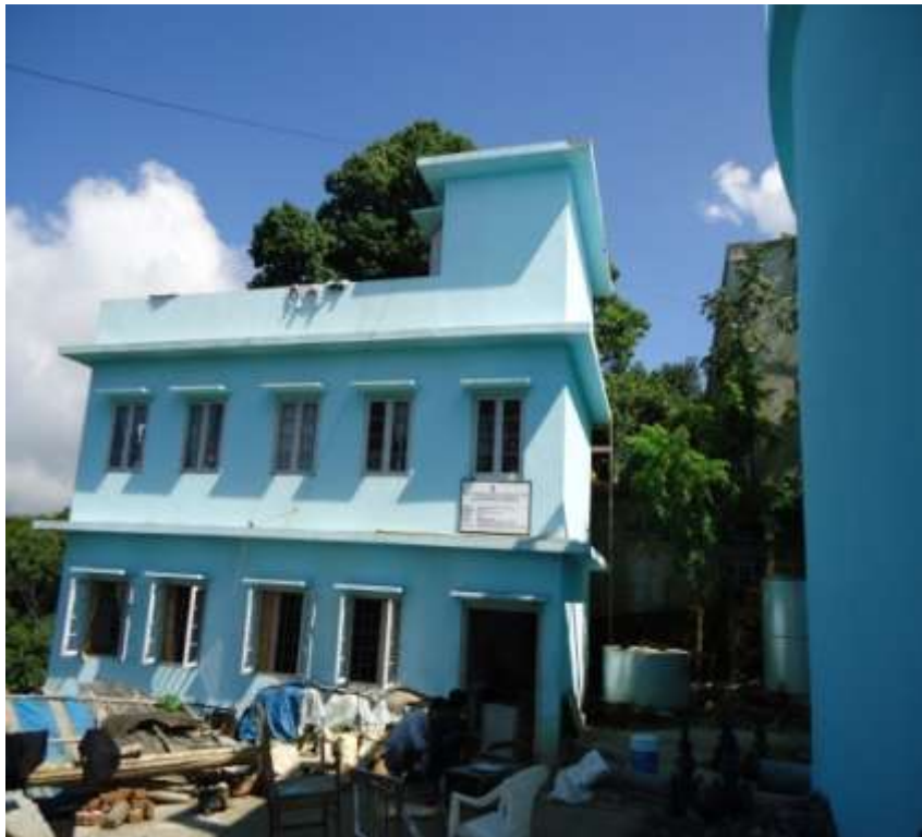
7 th Day Tlang